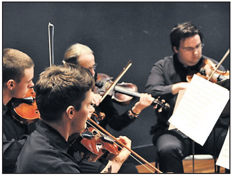
Pulling strings: The Endeavour Chamber